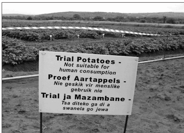
Public research to serve private interests? GE potato trials at the Agricultural Research Council's Vegetable and Ornamental Plant Institute at Roodeplaat.