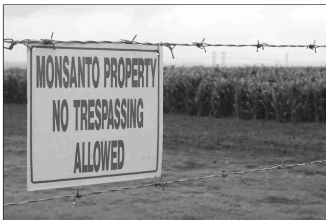
Monsanto test farm in Petit, South Africa.