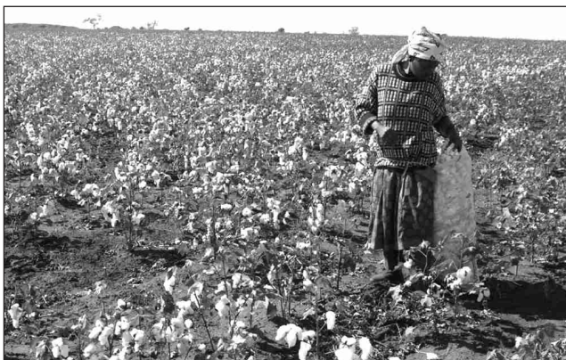
Harvest time for GE cotton in Makhatini. Women do most of the work in the cotton fields, but often have little decision-making power