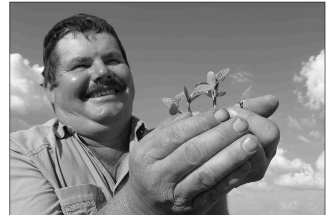
GE crops - feeding or fooling the world? Bt soya farmer in Mpumalanga.

It is also claimed that using GE crops will reduce pesticide and herbicide use and so promote environmental protection. Of course, it makes little business sense to an agrochemical company to reduce a farmer's dependence on chemicals. And it is not the intention. On the contrary, the aim is to create crops that are more rather than less dependent on the use of chemicals. Until now, most research undertaken by the biotechnology industry - a whopping 77% of all genetically modified crops - has focused on making crops resistant to their own 'broad spectrum' herbicides. For example, Monsanto's Roundup-Ready crops are genetically engineered to be resistant to the company's glyphosate herbicide, and Ciba-Geigy's crops are modified to be resistant to its glufosinate-based 'Basta' herbicide. What this means is that a field can be sprayed with chemicals to kill all plants