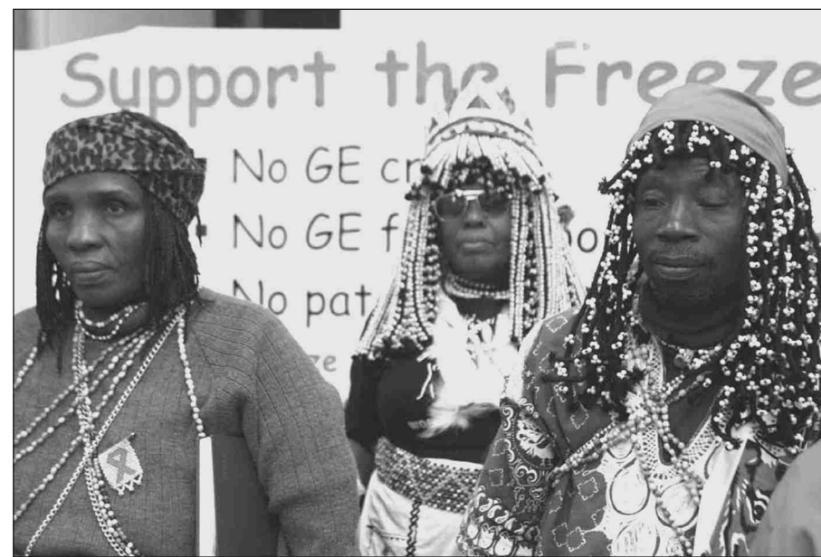
Traditional healers join the demand for a moratorium/freeze on GE crops

Governments too are taking actions against genetic engineering, in an attempt to protect their markets and the rights of their consumers and farmers. Thailand and Sri Lanka, for example, have banned GE crops and seed imports, as have Bolivia, Paraguay and a host of African countries. Many states and municipalities have declared GE-free zones, and in Europe a de facto moratorium exists on the introduction of new GM crops.