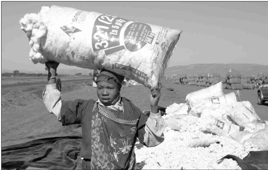
Woman delivering GE cotton after harvesting.

well to reflect on these developments, many of which directly contradict the 'people, planet and prosperity' objectives of the Summit. While the past decade has witnessed some important initiatives, such as the adoption of a Biosafety Protocol to regulate the import and export of GE crops, it has also demonstrated some disturbing trends. As governments become subservient to corporations instead of citizens, the environmental and health risks of GE are being blatantly ignored. So too are the risks to small farmers, and the broader implications of the wholesale adoption of this new technology. GE crops offer remarkably little in the way of benefits, but have extremely high potential costs, facts that are not lost on the millions of